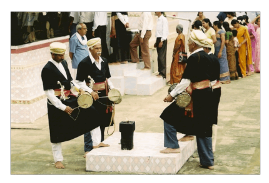
Fig. 6: Four Kodava men, wearing traditional dress, perform dudikotapat at Kakotaparambu. The man second from the right was not manually increasing the tension of the skin at this point.

perform, singing is often done in shifts, and it is sometimes amusing to watch the efforts of a singer to find someone to take his place.