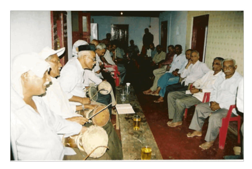
Fig. 2: Karana pat performed at the Ain-mane (ancestral house) of the Mevada okka.

As each living person is named, they are expected to honour their older relatives and make a prayer offering at the nellaki bolca , a clay lamp in a niche in the western wall of the central hall, that forms the centre of devotion in a traditional Kodava house.