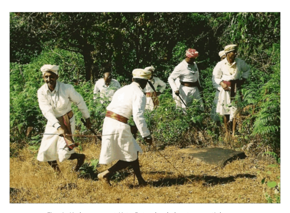
Fig. 4: Kodava men at Kota Beta play kolayat , a martial game. The long-sleeved white kupya , worn over shorts or rolled up trousers , is worn by only a few groups in more remote parts of the district . The more common black kupya is seen in Figure 6. Amongst other groups of Kodava, kolayat is generally very stylised and safe.