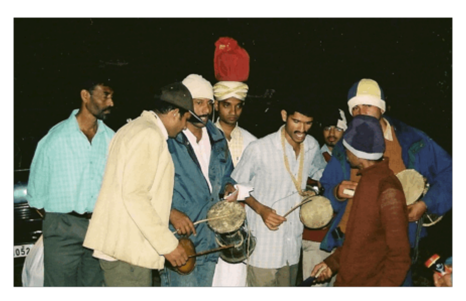
Fig. 1: Procession to the shrine of Kakotaparambu. The koyimes are wrapped in the