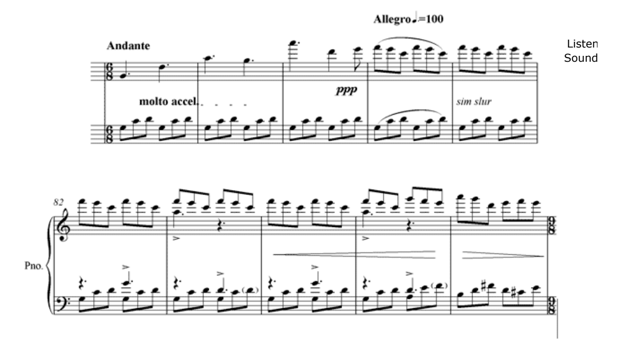
Fig 6: Smith, Paul. (2010) Extract taken from IV. Pikachu – Kawaii Suite.

The fifth section, acts a coda within the macro structure of the piece. The 6/8 time signature is set up and breaks away towards the end, the lilting three-note repeated passages act as barriers as the notes of the motif move between register.