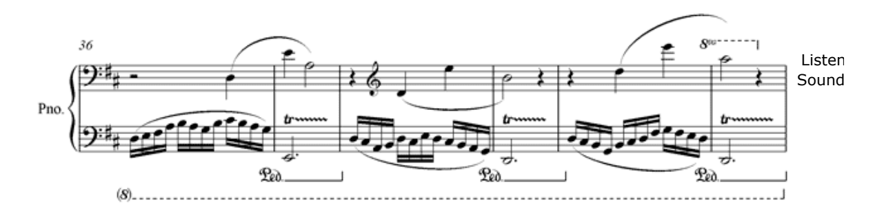
Fig 4: Smith, Paul. (2010) Extract taken from IV. Pikachu – Kawaii Suite.

It occurs to me that if Pikachu is to embody these starkly different gender traits whether they be masculine or feminine, there must be a transition period. Lunsing (2003) refers to the transformation period from masculine to feminine, and the motif appears in the second section therefore transitioning between gender traits. As it appears here it is played simply, as crotchets and minims in a steady 3/4 time signature, however it is played against bass trills and prestissimo scale passages, making it somewhat difficult to identify. Soon though, the motif begins to rise and climbs in pitch towards the higher register in which it sits in the third section. Moving from clouded and complicated, to soft and simple, a similar inconsistency to Pikachu's actions. The motif becomes largely drawn between two extremes. This reflects the contradicting gender states of Pikachu.