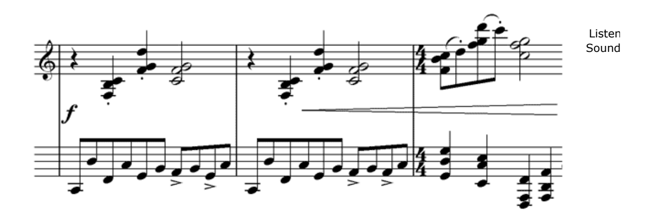
Fig 2: Smith, Paul. (2010) Extract taken from IV. Pikachu – Kawaii Suite.

The second image and sound clip are how it is heard during the first section of the piece.