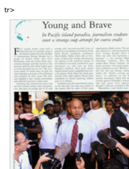
Figure 3: 'Young and brave – Fiji's student reporters cover coup,' IPI Global Journalist , 3rd Quarter, 2000, pp. 26-28.

Editors were drawn from the third year News Production course, subeditors were on the second-year Print and Online Journalism paper and reporters were on the first year Introductory Journalism and Media Law and Ethics papers. All reporters turned up at the newsroom to be briefed and were assigned to do news stories and pictures, or offered their own stories. Some editors were in charge for a complete semester, others worked in split