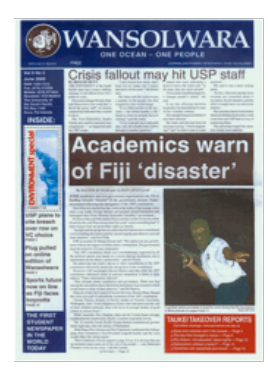
Figure 2: Front page of the controversial Wansolwara 'coup edition' which survived a university attempt to prevent its publication, June 2000.