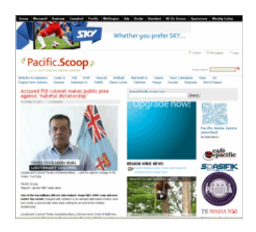
Figure 9: Pacific Scoop coverage of the Ratu Mara's YouTube allegations against the Fiji regime from Tonga. A breaking news story, 14 May 2011.

There are television and radio channels devoted to the Pacific but they are aimed primarily at a Pacific Islander audience. Pacific Scoop appeals to a wider audience, it can (and does) publish controversial material and, other than the blogs, readers interested in Pacific Islands affairs have nowhere else to go... Its neutrality and political balance gives it entry to places where the more polemical blogs rarely trespass. I think its greatest weakness is its vulnerability: it relies too heavily on the work of one man, and it operates on limited finances. (C. Walsh, personal communication, 26 May 2011).