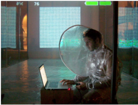
Ahmed Basiony, Thirty Days of Running in Place , Installation Documentation, 2010.

The original version of Thirty Days of Running in Place was presented at the 'Why Not?' exhibition in Cairo in 2010. [1] For thirty days, in a room enclosed in transparent plastic outside the Cairo Opera House and Palace of Arts, Basiony jogged for an hour wearing a plastic suit fitted with digital sensors that gathered and wirelessly transmitted data on his movements and other physiological parameters. The information gathered was then processed and projected onto a large screen as an ever-changing visual and aesthetic reflection of the artist's physical state. Described by curator Omar Koleif as 'evidence of the artist's belief in art functioning as a primal mechanisation of the self', Thirty Days Running in the Place is an 'abstract portrait of a body not just in motion, but changing physiologically under the influence of exercise' (Koleif, 2011).