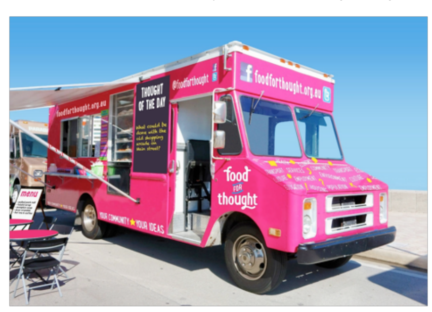
Figure 5: Concept prototype for the Food for Thought bus: a mobile, multi-sited public art project.

The insider stories told in our workshop took us through narratives of aspirations, hidden/invisible places, tacit mappings of the world, journeys and movement. They showed us the otherwise unrevealed elements of life in Western Sydney that are not appreciated by narratives that cast the area as a 'problem' or 'tragedy'. They told us of the joys of living there, as well as the need to leave as young people, along with there being a possible later return (with kids). These stories began to build up a consistent image of the forms of wellbeing, and the ways of belonging and wanting to leave, that were part of being from Western Sydney. They demonstrated the need to collaborate with people living in the area, to generate more stories of past and present ways of living and being in Western Sydney, and to use these to invite and document imagined futures for the proposed sites of the commons and what they might be and be called in the future. To do this we developed a hypothetical mobile, multi-sited public art project. Inspired by what was meaningful to those people who loved living in Western Sydney described in the insider stories of our group, and by the kinds of things that typically contribute to a sense of the commons, we developed four themes: sharing, cooking, drawing and planting.