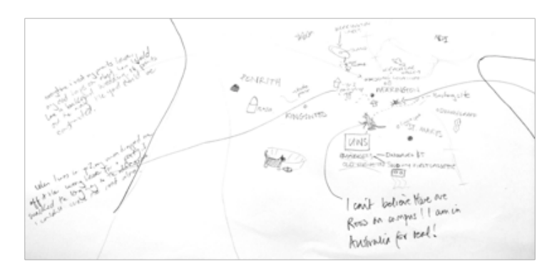
Figure 4: Those of our group who were 'insiders' mapped their journeys and movements through Western Sydney, showing us otherwise unrevealed elements of life in the area. This particular map depicts Penrith and surrounds.

To achieve this we propose a suite of methods for imagining the future that seek to engage the past-present-future relationship as a form of understanding the Riverlands and their 'problems' and opportunities. Based on ethnographic, speculative and collaborative principles they therefore involve the researchers/designers going to where those people we wish to involve in this work already are and to engage with them in their localities. This avoids 'parachuting in' and would instead create research environments by working with organisations with strong local links, and that are neutral but active, mobile, and invite local participation.