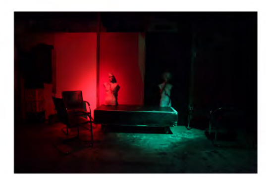
Figure 2. Dummies 20-5-11, (Photograph taken by Author, 2011).