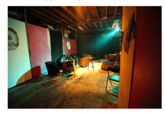
Figure 3. Green light, 7-10-11, (Photograph taken by Author, 2011).