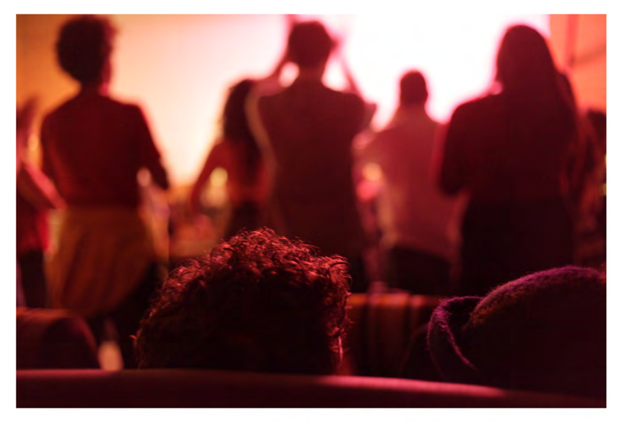
Figure 9. Your view, (Photograph taken by Author, 2012).

While this was an option for capturing the space, it was at this point that I really understood how vital my experience of the space was to the documentation. If I felt cramped to the point of claustrophobia inside a space, as I did in Figure 7 then that needs to be translated to the viewer. This project, as previously expressed, is not about the performer on stage and capturing the best angle of the lead singer, it is about contextualising a phenomenological understanding of space and place as explored experientially through the lens of my camera. While the heat in this space was unbearable, the vibe was electric and it was from here that I took comfort in the confines of other bodies around me. When a space was not necessarily full or the audience were sitting (this is often due to the kind of performance that requires attentive listening) I too would sit, (as seen in Figure 9) and shoot through the people watching, or shoot from the perspective of others in the room, wanting to capture what it was that they were experiencing, as opposed to a superficial view. Engaging in these practices began to solidify my place as an empathetic insider.