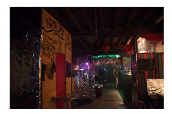
Figure 4. Armoury, 4-5-12, (Photograph taken by Author, 2012).

In Figure 2, I capture what I first glimpsed from the threshold. That is, two dismembered and disfigured dummies bathed in two pools of contrasting light, one red, and one green. The curling stitches swirl across the bare chest of the female torso and the lighting creates two very different reactions to these strange actors.