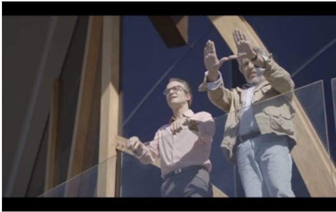
Figures 6 and 7

The narratively complex and ontologically impossible constellation presented within these ten dense minutes can be captured in its entirety (Figure 8).