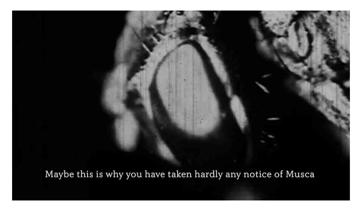
Figure 2: Still from Musca. Excerpted from Disease Carriers: A Film Lesson in 'Health' and 'Hygiene', De Vry School Films, 1928.