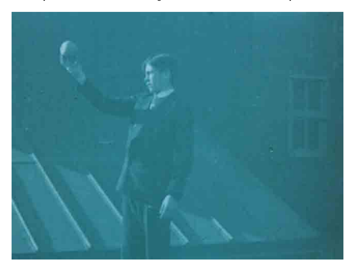
Figure 1: Still from Moonrise . Excerpted from Sky: A Film Lesson in Nature Studies, De Vry School Films, 1928.

Moonrise was the first film in our quartet to be completed. It has been selected for many film festivals and screenings in Australia and internationally.