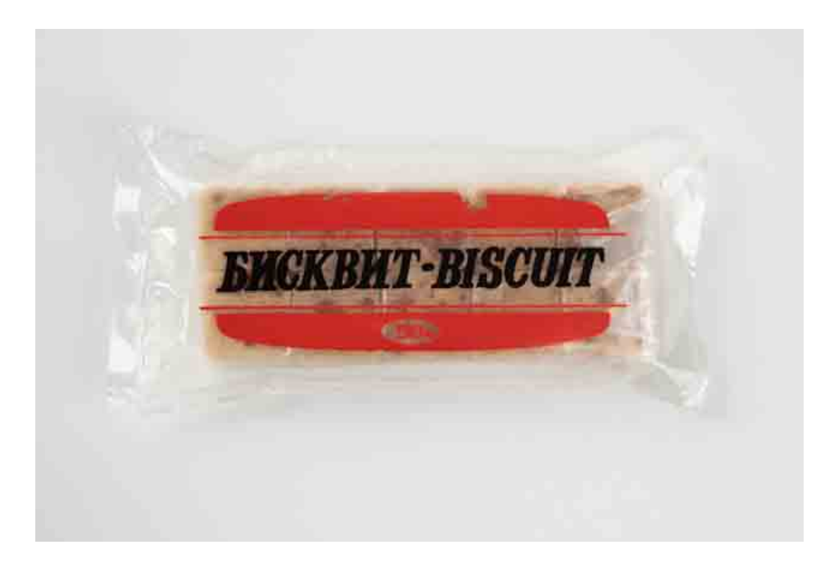
Figure 3. Still from Memorabilia . Soviet space food package of biscuit.